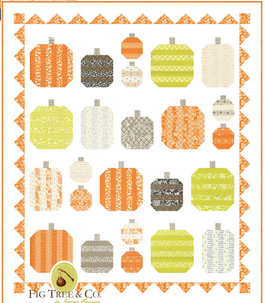
LAYOUT ON CREAM FABRIC