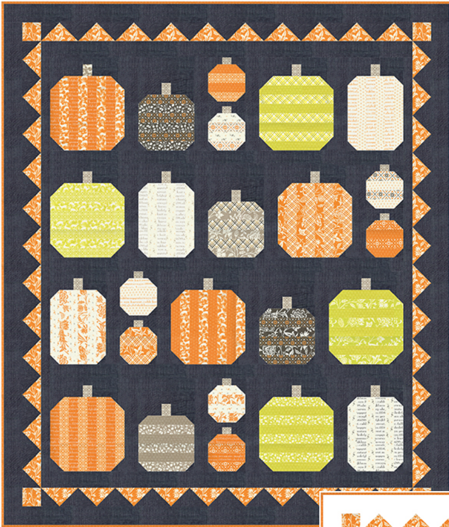
LAYOUT ON CHARCOAL FABRIC