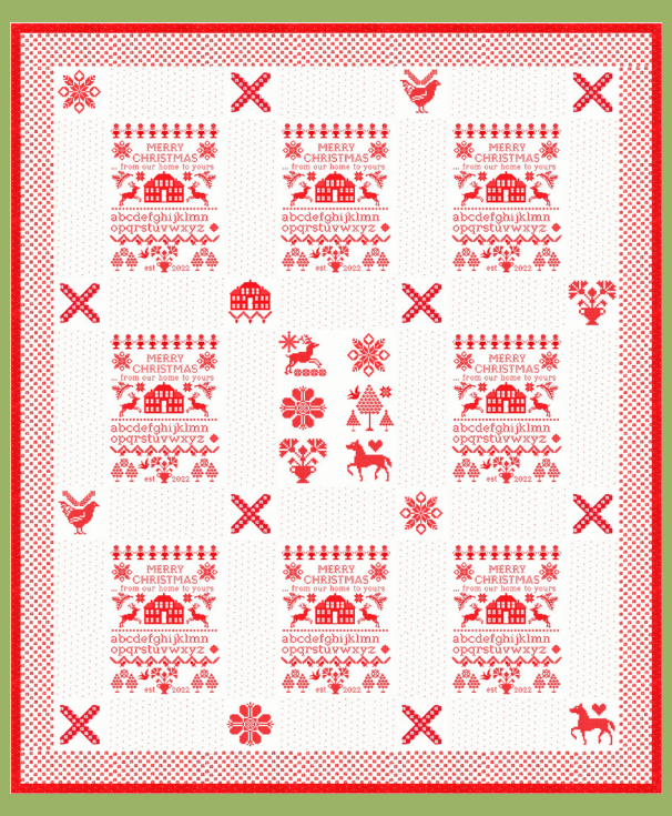
FREE PATTERN From Our House To Yours Comes as 2 versions -Size 48" x 57" uses 2 panels. Size 31" x 41" uses 1 panel (not pictured).