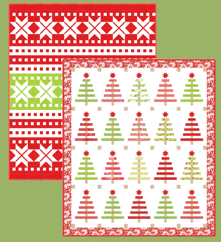
FT 1826 Yuletide Spruce 60" x 70"