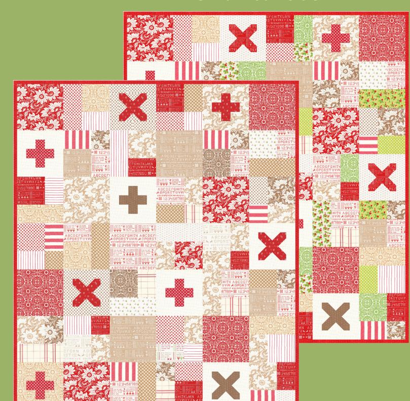
FT 1829 Vintage Scrapworks Red & Tan Version 60" x 70"